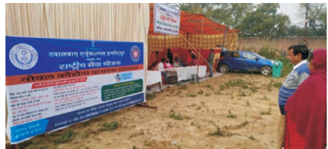
NSS-DEI made villagers aware to fight against corona virus during medical camp on 8 th March 2020.