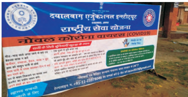
Public awareness on protection from Coronavirus by NSS volunteers.